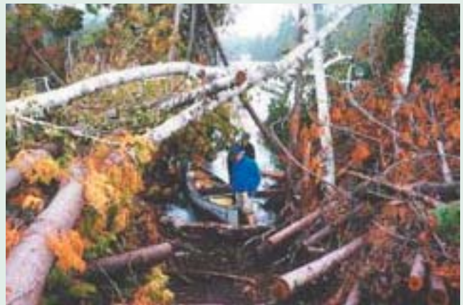
Figure 4. During the summer of 1999, powerful storms ripped through the Boundary Waters Canoe Area Wilderness, damaging nearly 400,000 acres of timberland. Controlled burns will be used to lessen the possibility of a massive fire.

Large forest fires scorch the soil and send burning embers up to five miles away. Once a forest canopy or large pile of logs is engulfed, a thick “plume” of pollutant-filled smoke rises into the atmosphere. In the best case, winds disperse the smoke. In the worst, wind transports the smoke to populated areas, then a