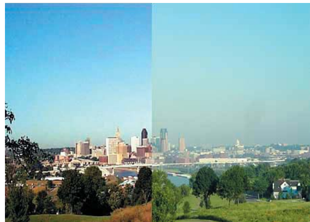
Figure 6. This composite photo of the St. Paul skyline provides a visual comparison of two different levels of fine particles—PM 2.5 levels of 5 µg/m 3 (left) to 35 µg/m 3 (right). Notice the difficulty in seeing buildings in downtown St. Paul on the right half of the picture. The daily standard for PM 2.5 is 65 µg/m 3 (micrograms of particles per cubic meter of air).

In Minnesota, sulfate is an important component of haze. Nitrate and organic carbon are significant in winter and summer, respectively. Since some fine particle pollution blows into Minnesota from