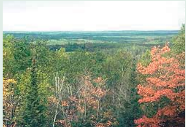
Figure 2. A Forest Service IMPROVE automated monitoring station just outside the BWCAW shows the distinct difference between a clear day (more than 125 miles visibility, above) and a hazy one (less than thirty, below).

The equipment at IMPROVE sites includes automated samplers to measure airborne particles and particle mass, along with light-monitoring equipment and a camera. According to Trent Wickman of the Forest Service’s Duluth office, “The contributions of pollutants at the [BWCAW] are clear. A large portion is ammonium sulfates, which are pretty clearly tied to coal combustion.” He added there’s not sufficient data yet to provide trend analysis, but that “we’re getting to that point.”