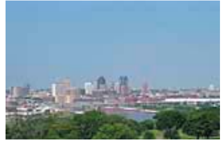
Figure 1b. On a hot June 2003 day with an AQI of 125, a haze dims the St. Paul landscape and Minneapolis disappears.