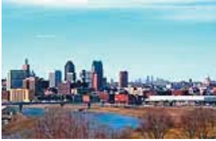
Figure 1a. On a bright March 2003 morning with an Air Quality Index (AQI) reading of 15, downtown St. Paul and the Minneapolis skyline are clear.