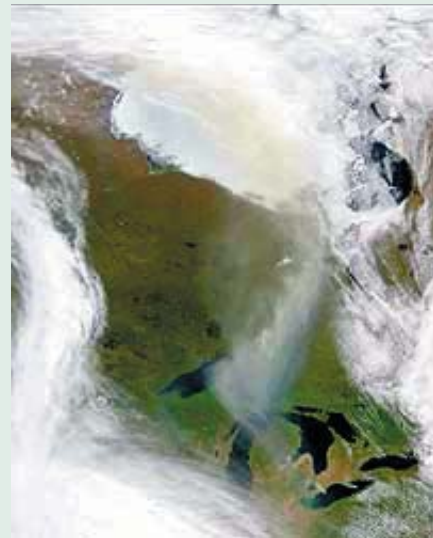
Figure 5. Smoke from an Alberta, Canada wildfire in May 2001 blows southward across the Great Lakes (seen in the lower right of this satellite photo), hiding much of Lake Superior from view.

More than 1,500 U.S. weather stations collect and assess current wildfire conditions, produce fire danger maps, and make fire weather observations and next-day forecasts. State and federal agencies compile data into larger fire-assessment tools and cooperate with fire watchers worldwide.