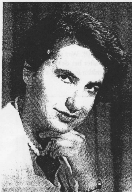
Rosalind Franklin